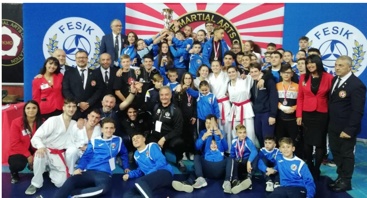
Regional Delegation Puglia (Italy), winner of the 1st WKMO World Cup